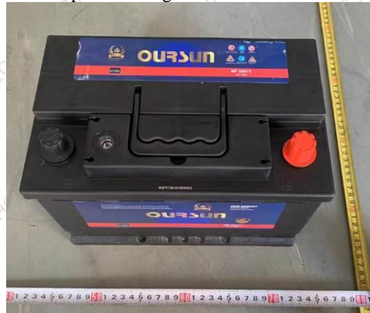
防止短路保护措施 protection against short circuit