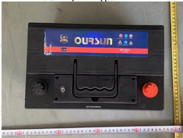
电池正面外观 Battery front appearance